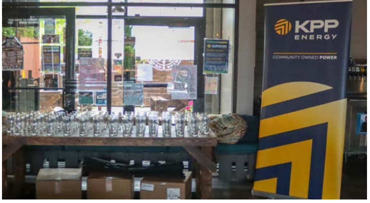
Above: Attendees received a KPP Energy pint glass.