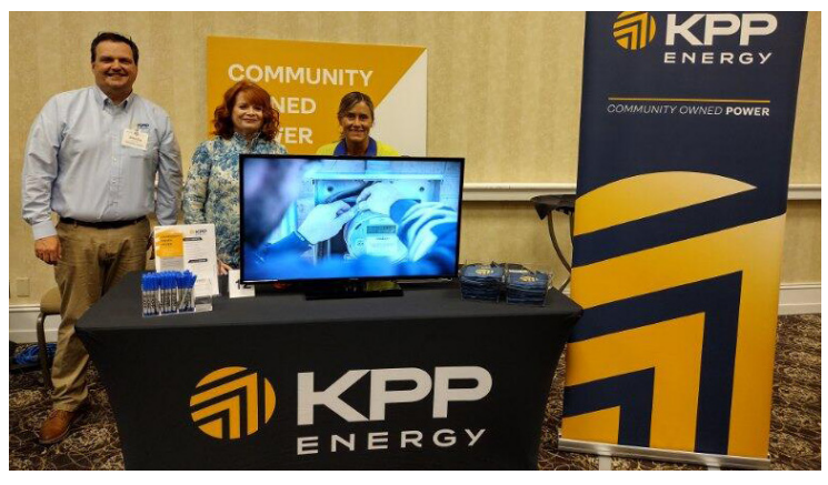
Above: KPP staff manning the exhibit booth.