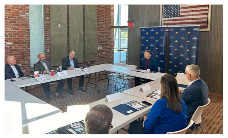
Above: Energy roundtable with Senator Roger Marshall.