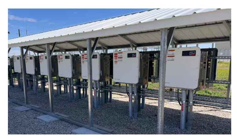
Above: A bank of inverters at the Fredonia Solar Farm.