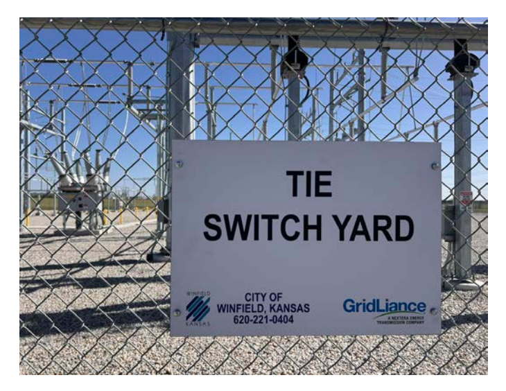
Above: New Tie Switchyard constructed by the City of Winfield and GridLiance.

inauguration of the new Tie Switchyard signifies a proactive approach to addressing future growth and mitigating power outages," noted Wall.