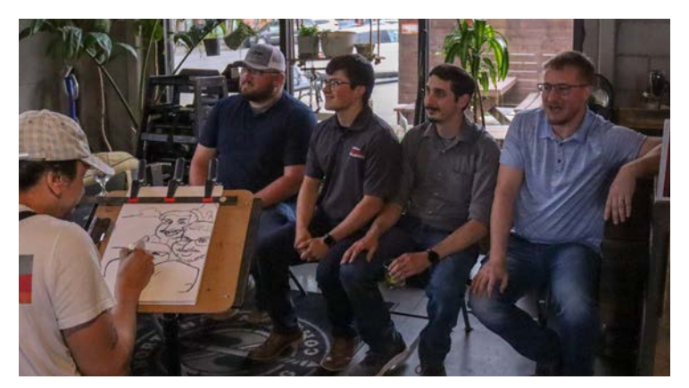
Above: City of Augusta power plant staff creating a "Mount Rushmore" caricature.