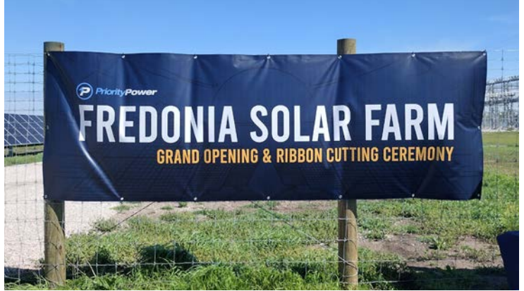
Above: Fredonia Solar Farm Grand Opening & Ribbon Cutting Ceremony.