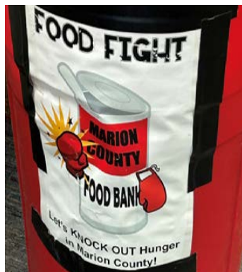
Above: City of Marion Food Drive for Public Power Week.