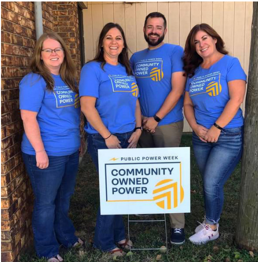
Above: Hillsboro City Staff