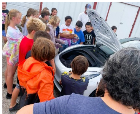
Above: Erie Electric Vehicle (EV) Event for Local Students.