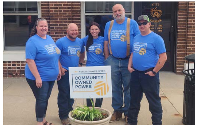
Above: Haven City Staff