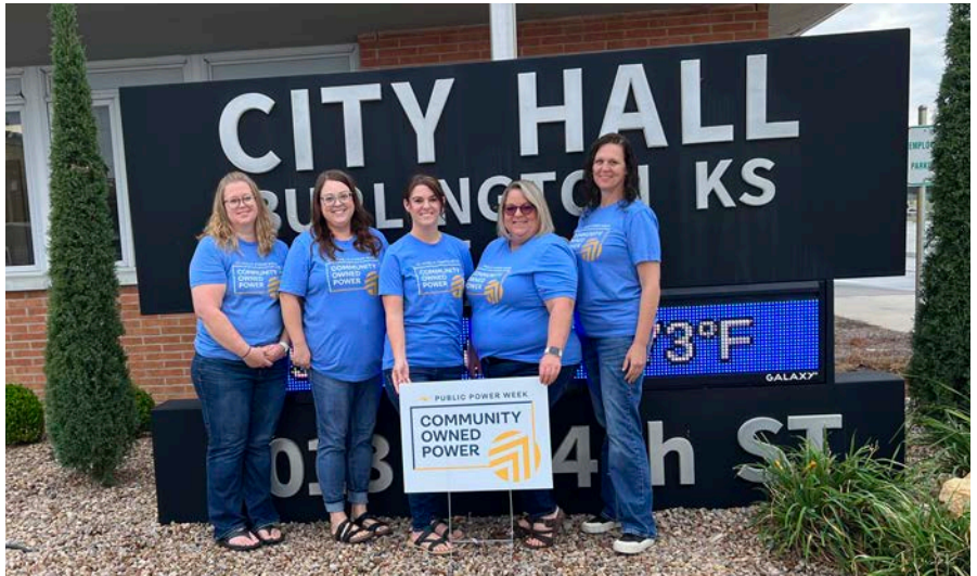
Above: Burlington City Staff